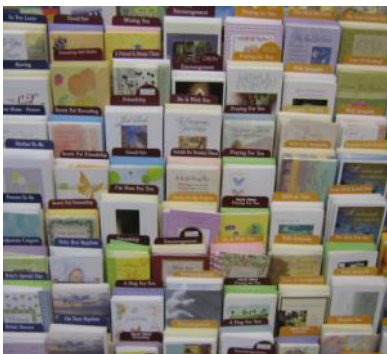
This Photo by Unknown Author is

What we do here at Living Saviour DOES make a difference to the neighbors that we serve! Thanks to all who are a part of this ministry!